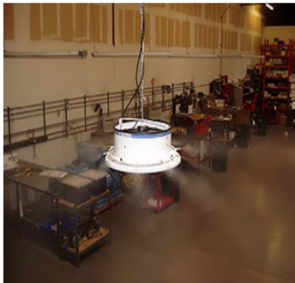
Applications include industrial sites where odor, dust, and humidity control is desired. Misting combined with a proper fan, can provide a high cooling effect.