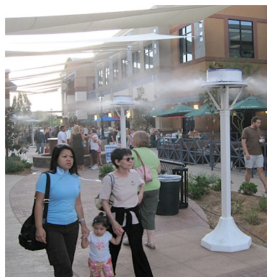
Entertainment industries apply misting systems for special effects, people cooling, and certain environments where a cool and fresh place is desired.