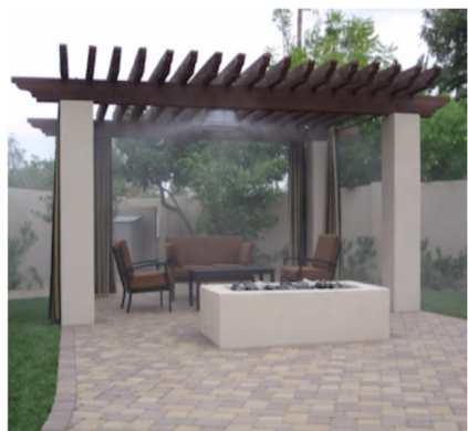
Mist fans can provide cooling in outdoor areas such as patios and green areas. Its unique design allows for a more uniform distribution of the fog and improved absorption of the moisture.